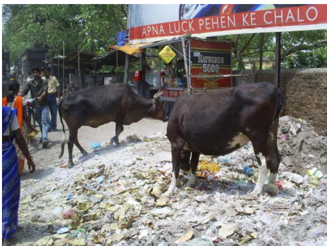
Cows eating rubbish in Gaya, India