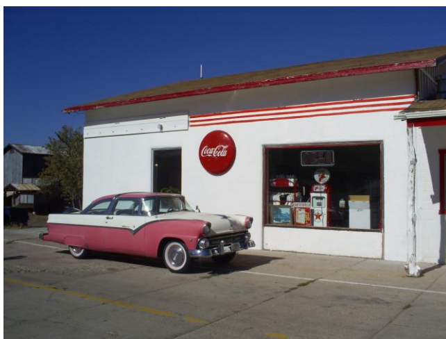
Sixties style garage, Williams, USA