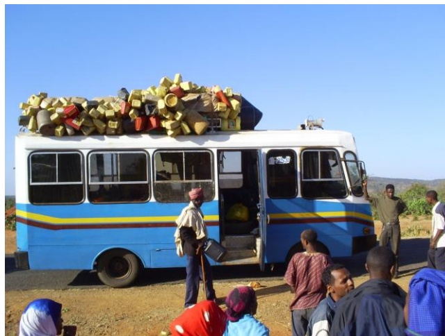
Bus from Moyale to Hagere Maryam, Ethiopia