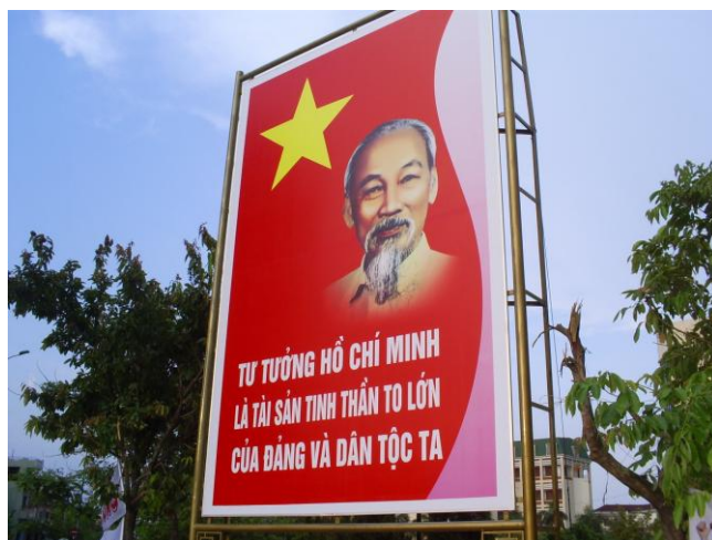
Ho Chi Minh poster, Hue, Vietnam