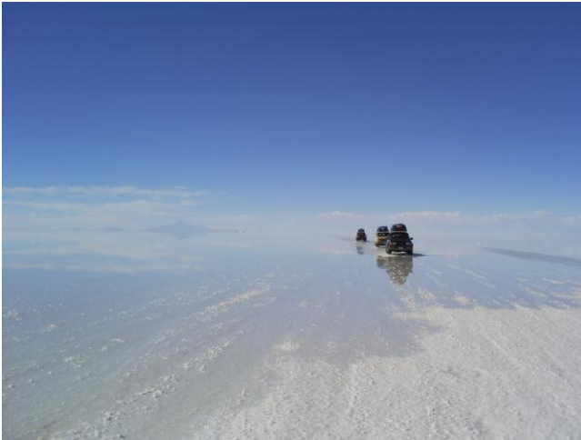
The Salar de Uyuni, Bolivia