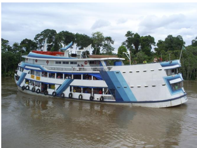
Riverboat on the Amazon river in Tabatinga, Brasil