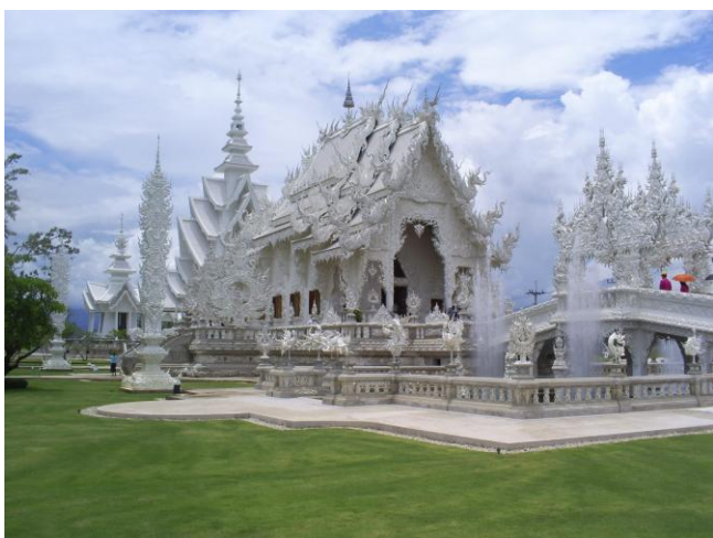
Wat Rong Khun, Chiang Rai, Thailand