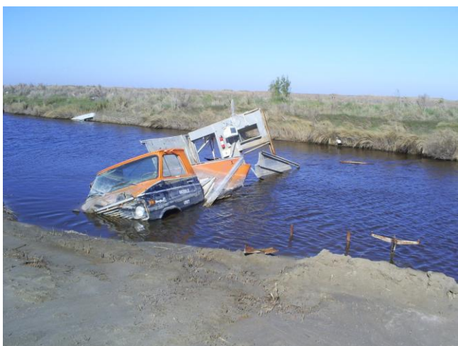
Devastation after hurricane Gustave, Holly Beach, LA, USA