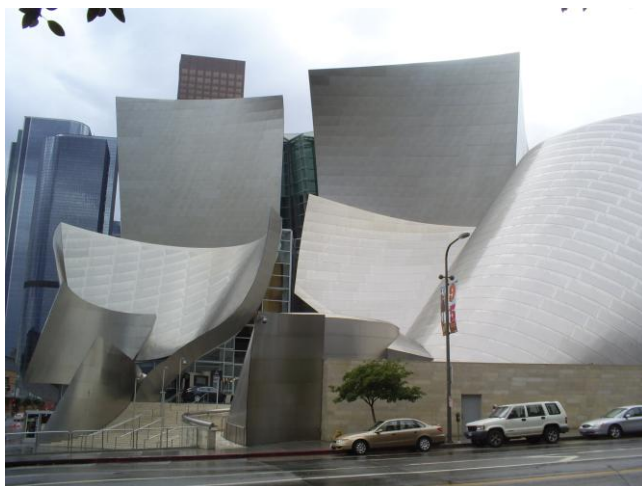
Disney Concert Hall, by Frank Gehry, Los Angeles, USA