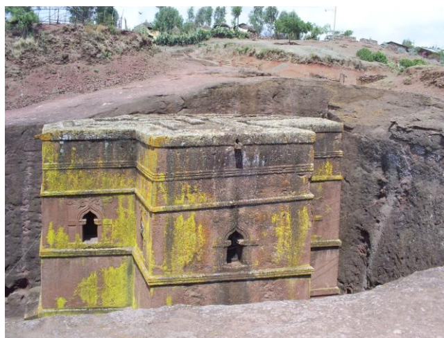
Bet Gyorgos, Lalibela, Ethiopia