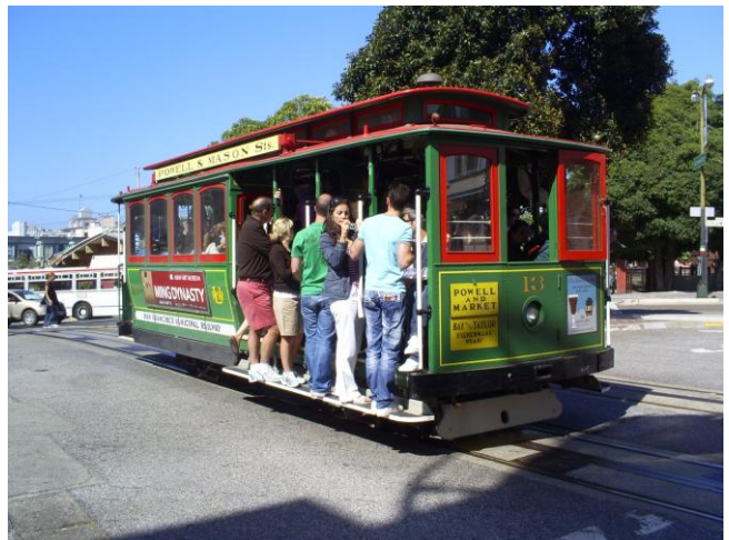
Street Car, San Francisco, CA, USA