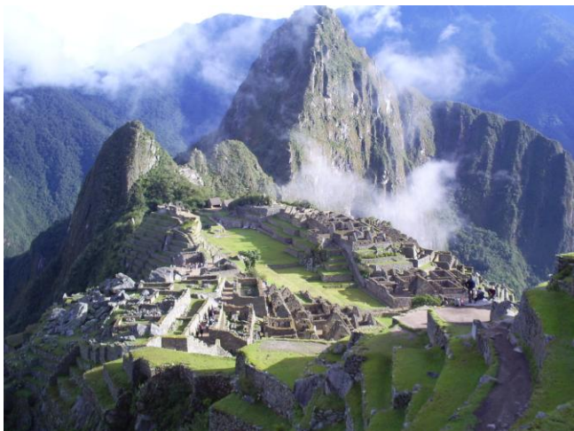
View on Machu Picchu from Waynu Picchu, Peru