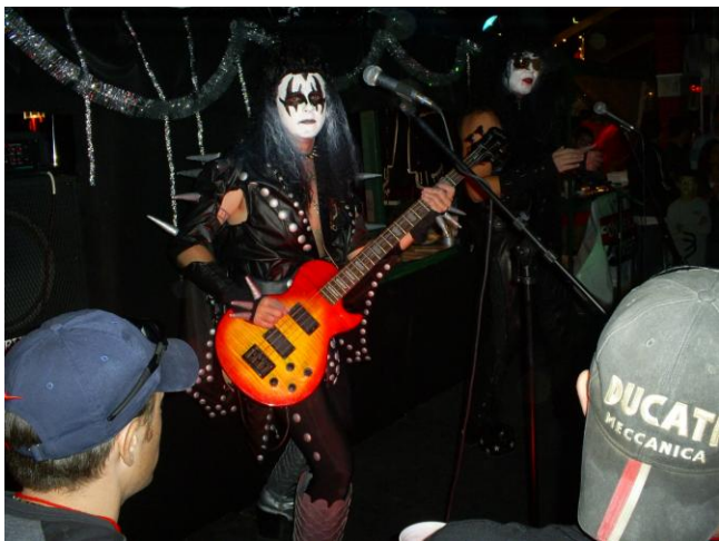
Kiss-alike band in Tucson, AZ, USA