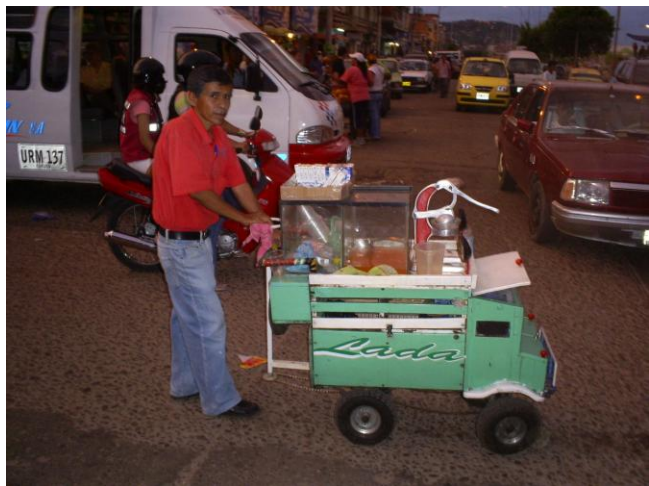
Street vendor in Cucuta, Colombia