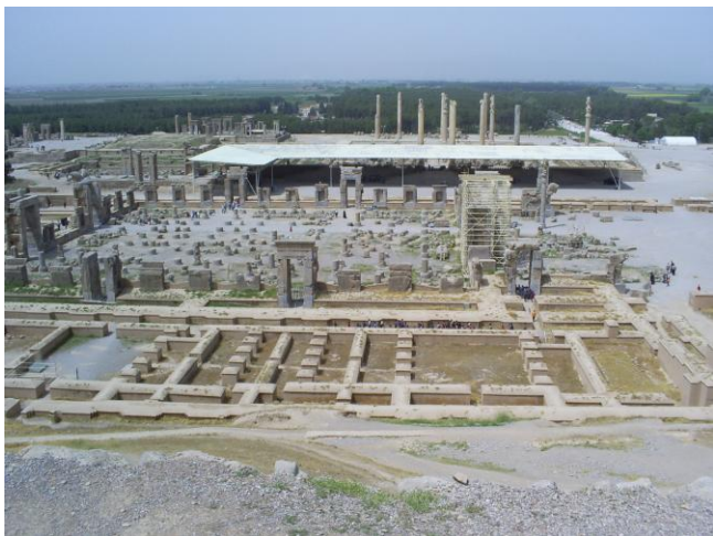
Persepolis, Marvdasht, Iran