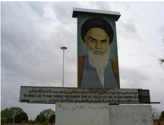
Imam Khomeini Shrine, Haram-e-Motahar, Tehran, Iran