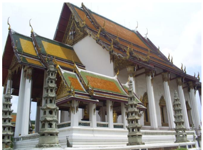
Wat Suthat Temple, Bangkok, Thailand