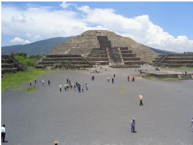
Piramide de la Luna, Teotihuacan, Mexico City, Mexico