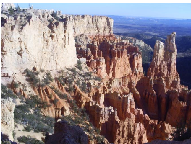
Bryce Canyon, USA