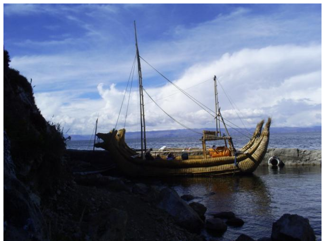
Traditional boat on Isla del Sol, Lake Titicaca, Bolivia