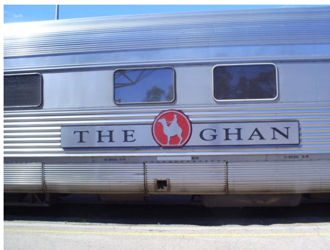
The Ghan at Alice Springs Railway Station, Australia