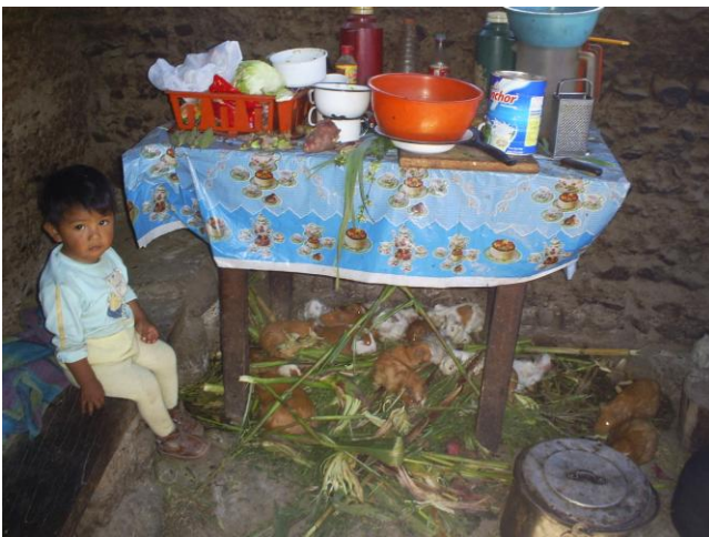
Guinea pigs under the kitchen table, Canon de Colca, Peru