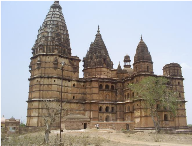
Chaterbhuj Temple, Orchha, India