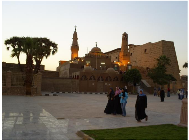
Luxor temple, Luxor, Egypt