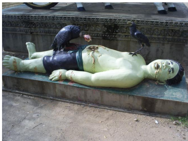
Sculpture in Wat Tam Rai Saw, Battambang, Cambodia