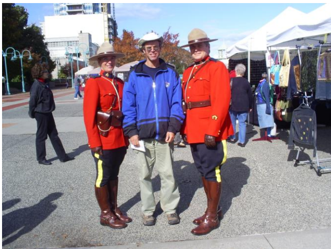
With Canadian Mounties in Victoria, Vancouver Island, Canada