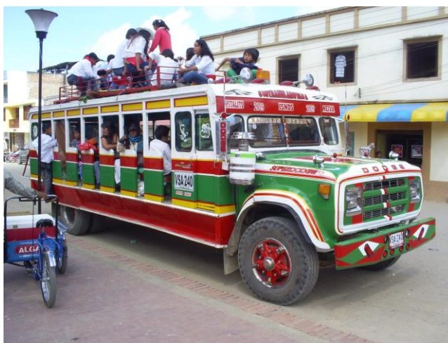
Bus in San Agustin, Colombia