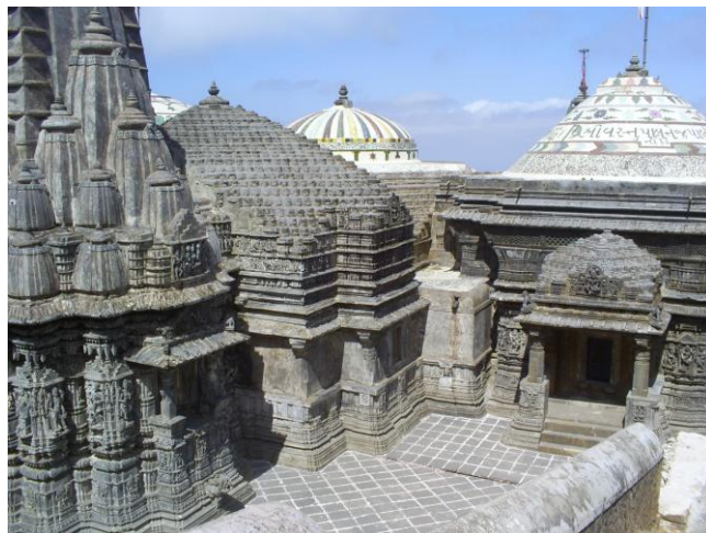
Temple of Varsupal, Girnar Hill, Junagadh, India