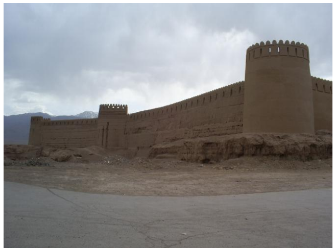
Arg-e-Rayen, Rayen, Iran