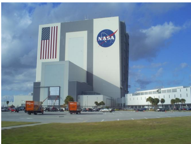
Kennedy Space Center, Cape Canaveral, USA