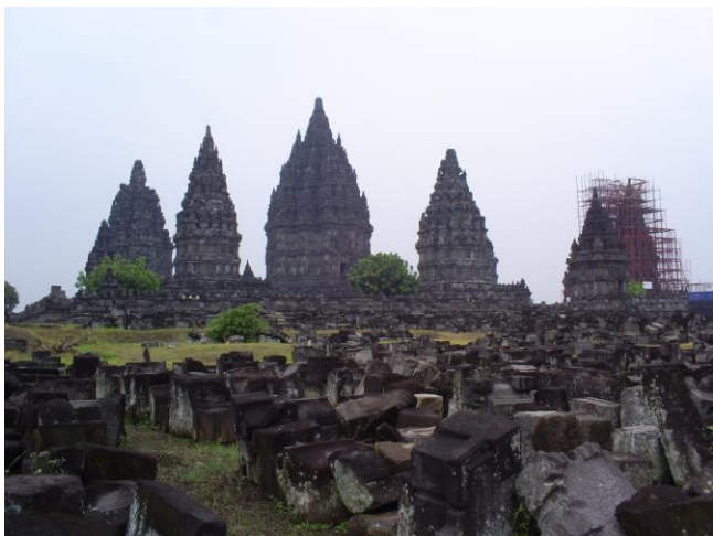
Prabanan, Yogyakarta, Java, Indonesia