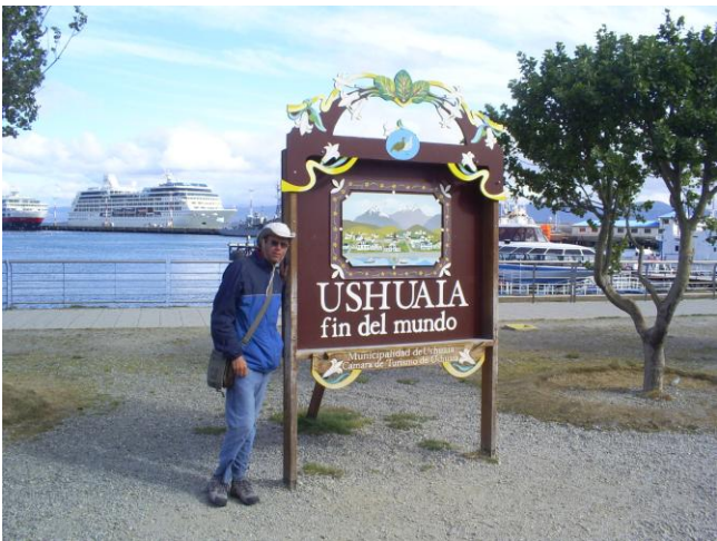
The author in Ushuaia, Argentina