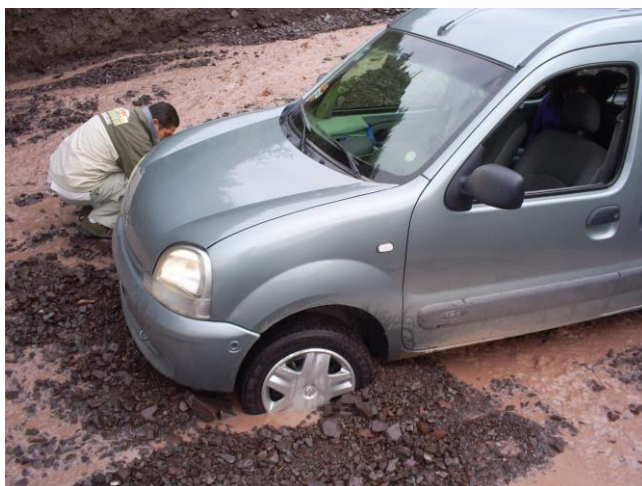
Stuck on the road from Salta to Cachi, Argentina