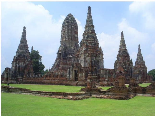
Wat Chai Watanaram, Ayutthaya, Thailand