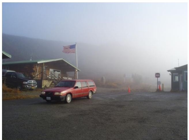
At the Alaskan border near Dawson City, Canada