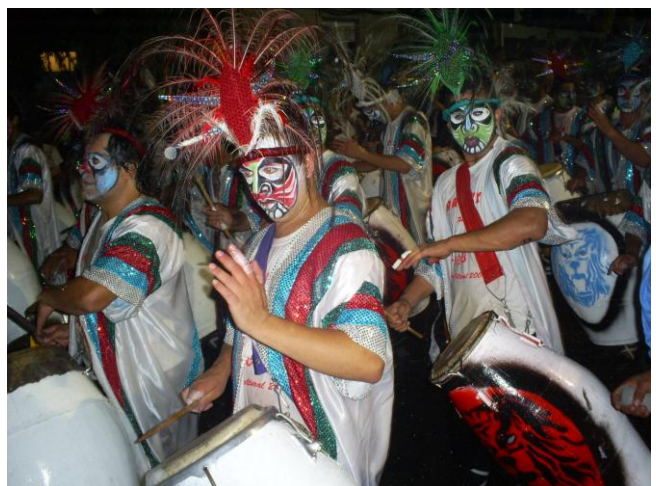
El Carnaval de Montevideo, Uruguay