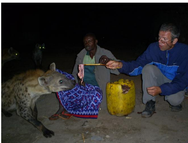
The author as hyena man in Harar, Ethiopia