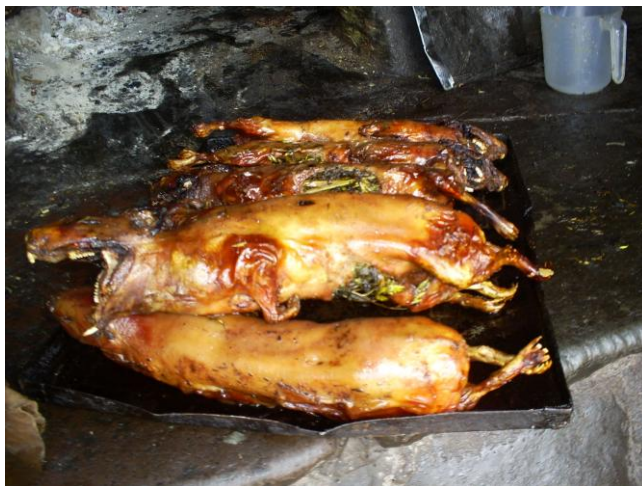
Fried Guinea Pigs, Cuzco, Peru