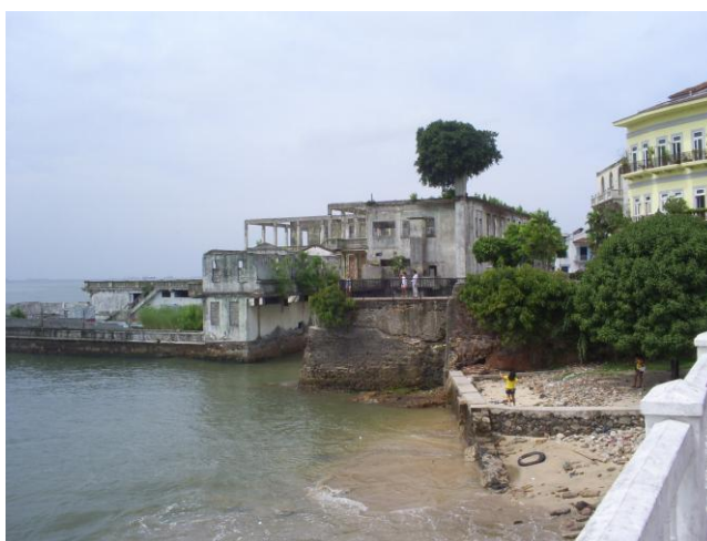
Clube de clases y tropas, Panama City, Panama