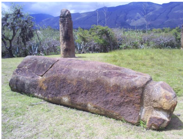
Stone phalluses in El Infiernito, Villa de Leyva, Colombia