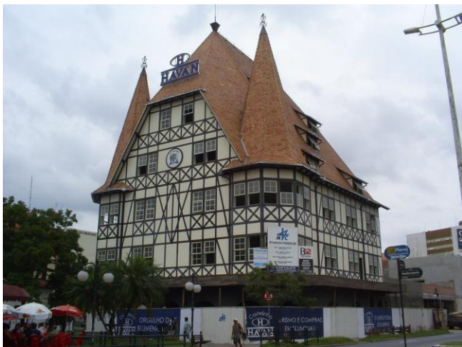
Blumenau, Santa Catarina, Brasil