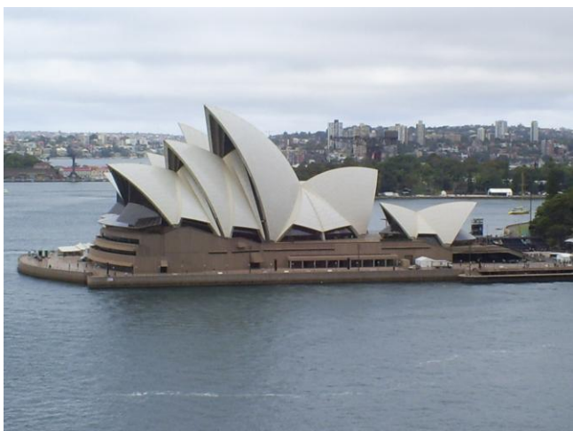
Opera House seen from Sydney Harbour Bridge, Sydney, Australia