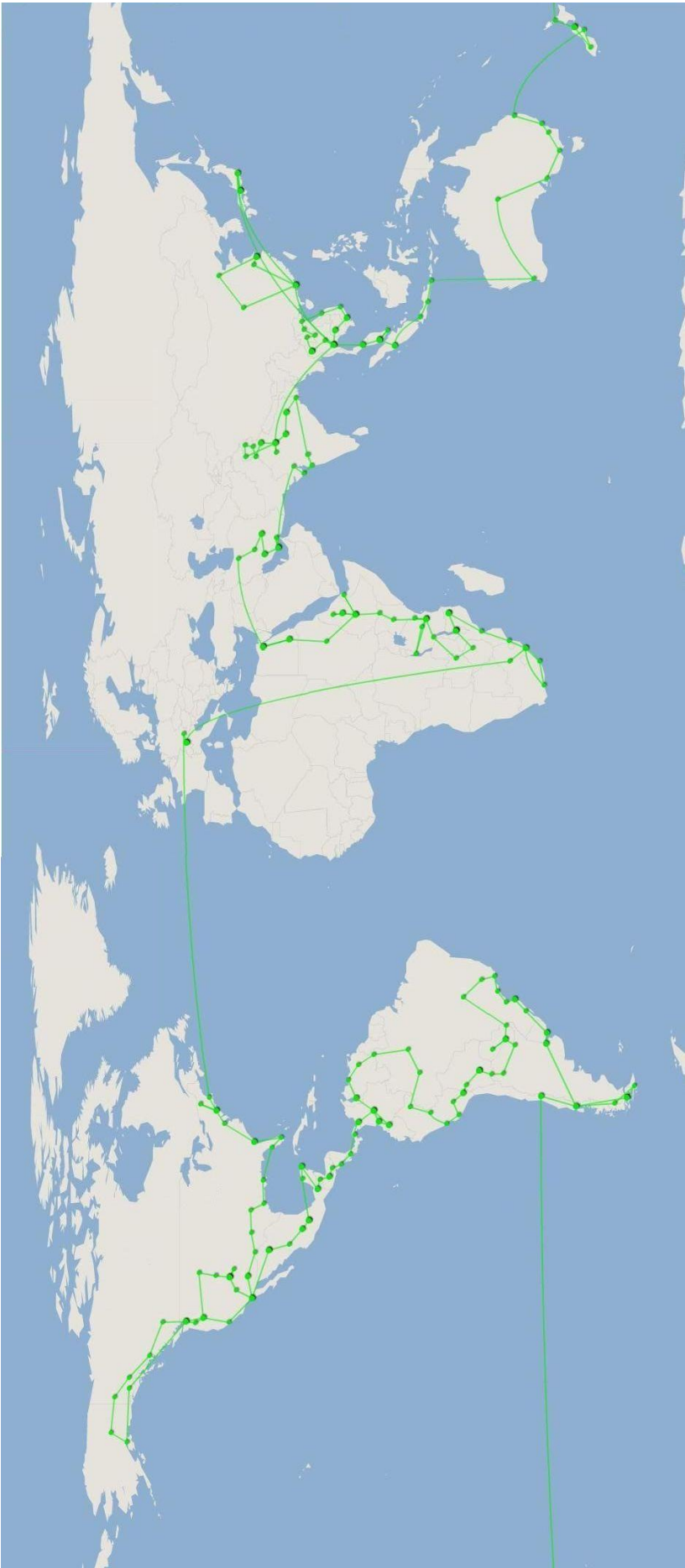
Map of Peet Lenel's journey around the world. The distance, if measured as the crow flies between major cities, was 141'398 km. Thereof , around 27'000 km were done in the red Volvo in Canada and the USA.