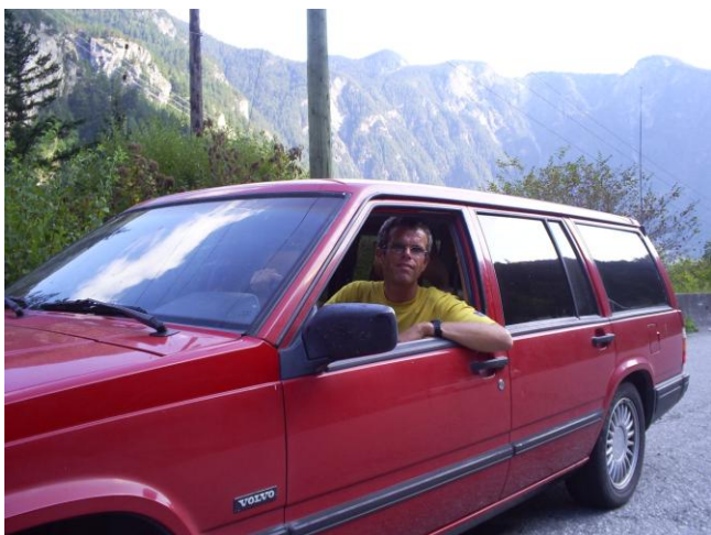
The author between Seattle and Spence's Bridge, BC, Canada