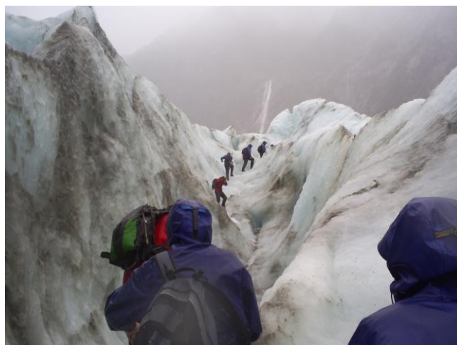
Franz Josef Glacier Tour, New Zealand