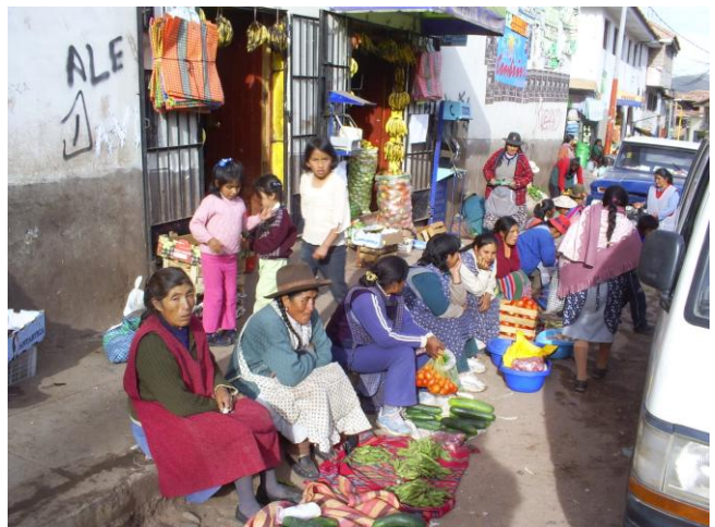
Street vendors in Cuzco, Peru