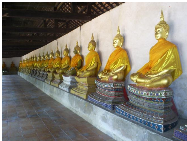
Wat Bhutaisavan, Ayutthaya, Thailand