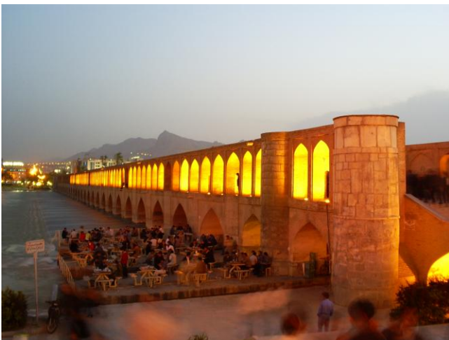
Si-o-Seh bridge, Isfahan, Iran