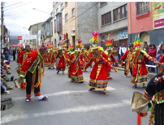
La Paz, Bolivia