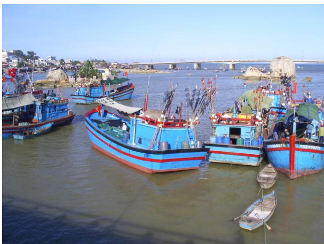
Hon Chong Promontary, Nha Trang, Vietnam