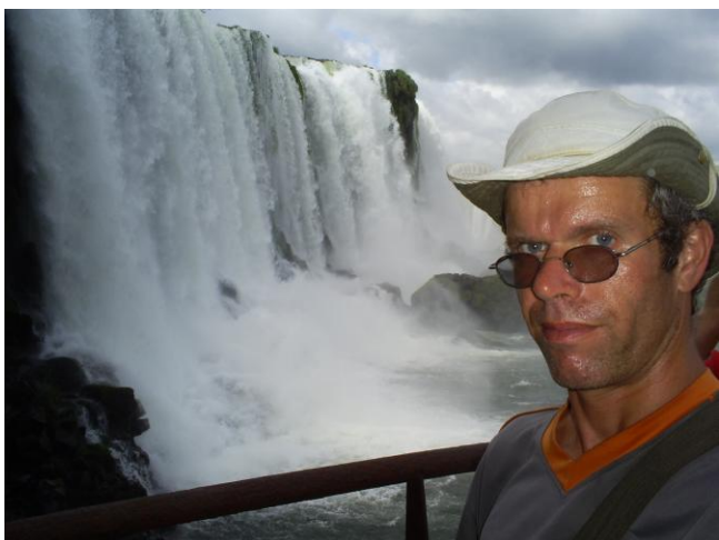
The author in Foz de Iguaçu, Brasil