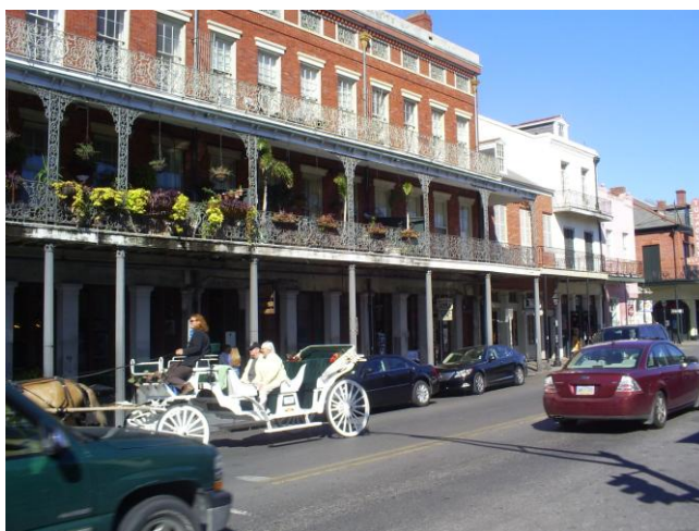
Quartier Francais, New Orleans, LA, USA