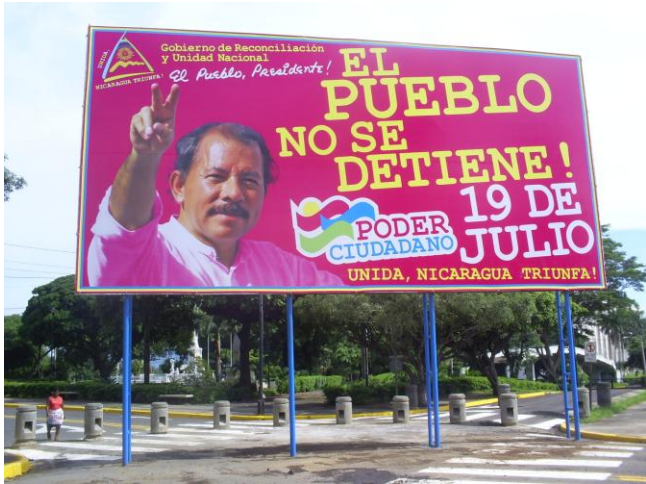
Election poster in Managua, Nicaragua