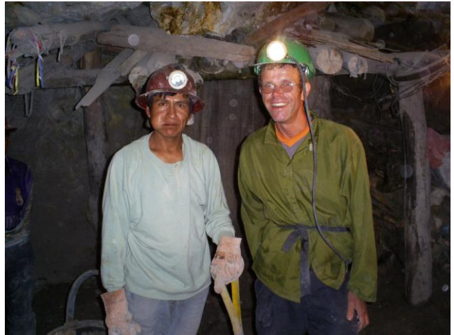
With a coca-chewing miner in the silver mines of Potosi, Bolivia