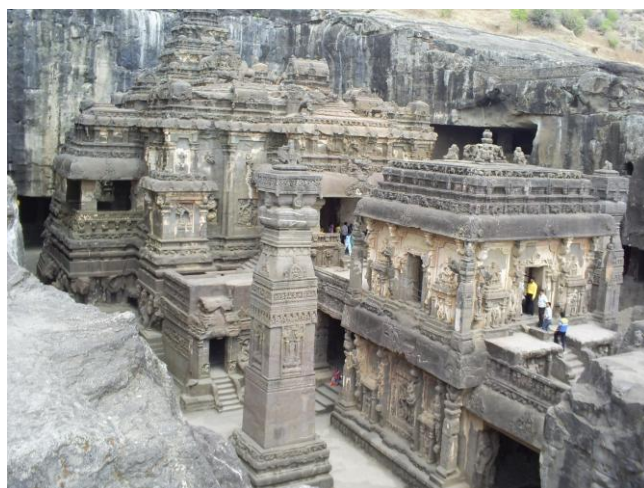
Cave No 16, Ellora Caves, Aurangabad, India