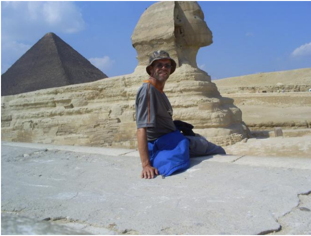
Sphynx and Pyramids in Giza, Cairo, Egypt