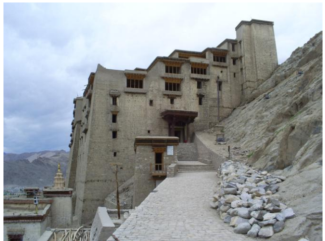
Leh Palace, Leh, Ladakh, India