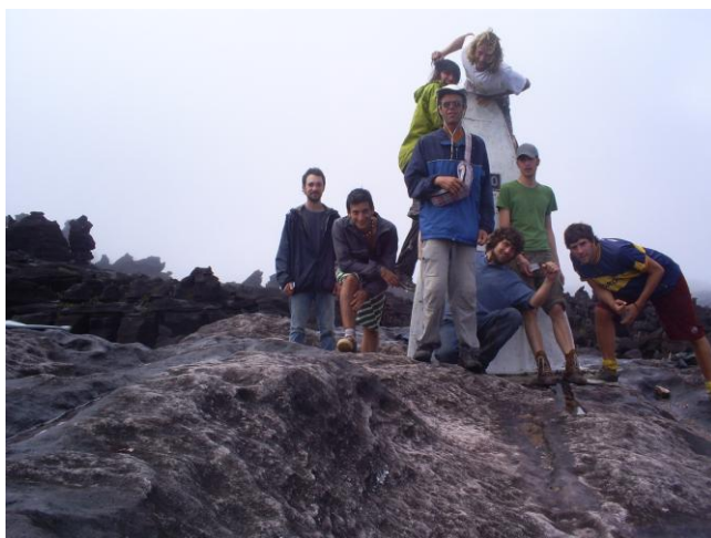
Our group on the Roraima, Venezuela