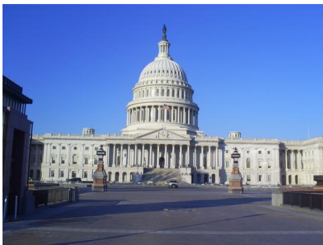
The Capitol, Washington DC, USA