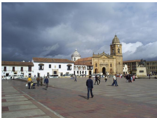
Plaza Bolivar, Tunja, Colombia