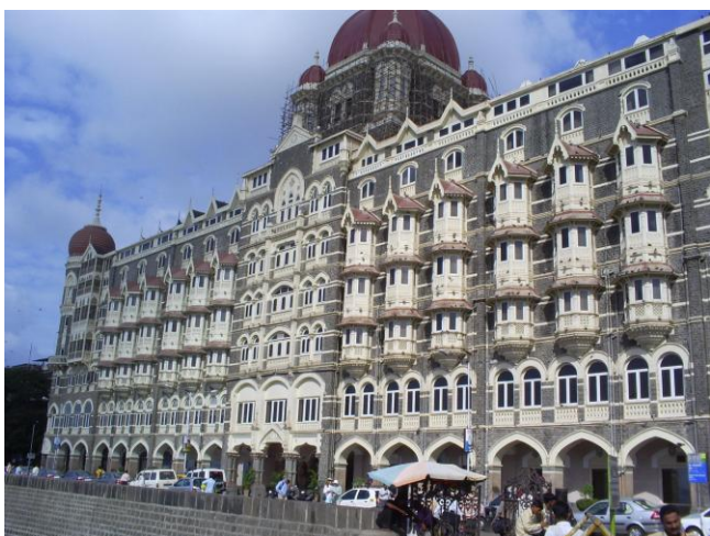
Taj Mahal Hotel, Mumbai, India