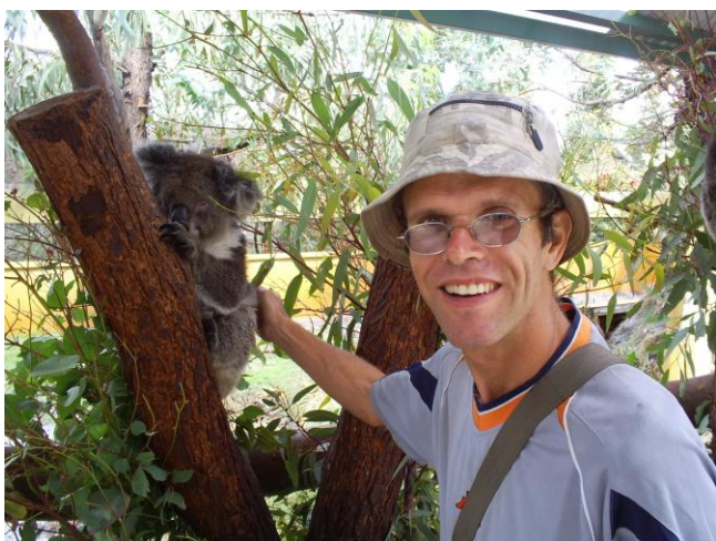
The Author and a Koala Bear, Caversham Wildlife Park, Perth, Australia