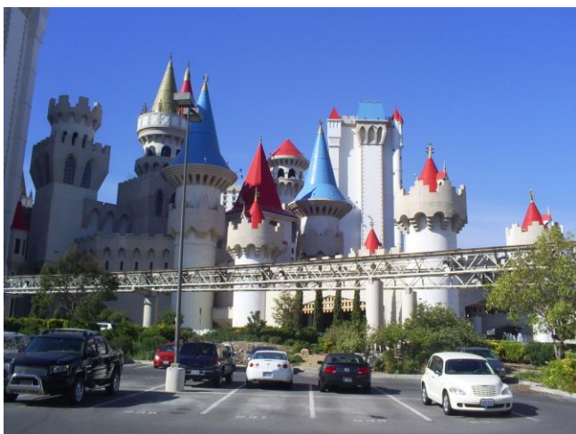
Las Vegas, USA