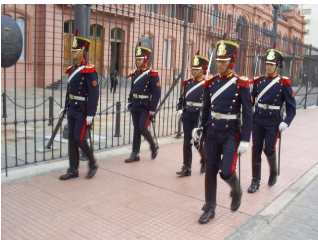
Soldiers in Buenos Aires, Argentina