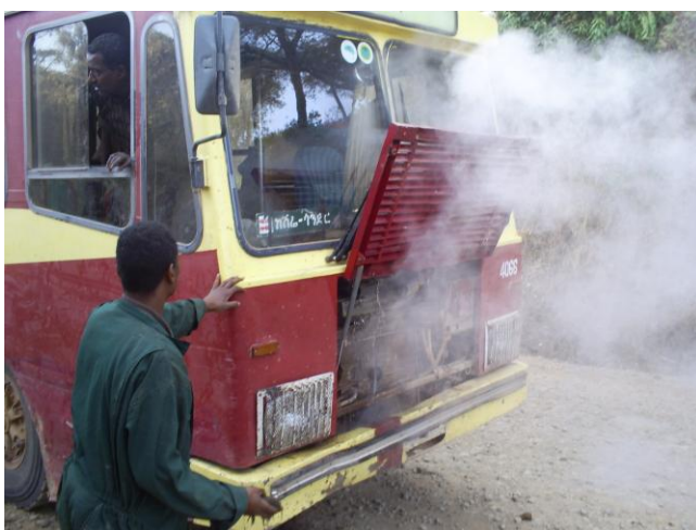
Broken down bus, Shire to Zarema, Ethiopia