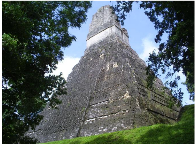
Maya Pyramid in Tikal, Guatemala