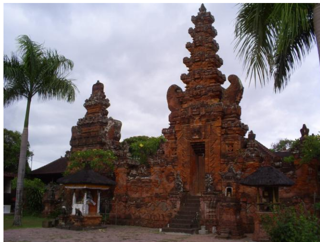
Royal Family Temple, Denpasar, Bali, Indonesia