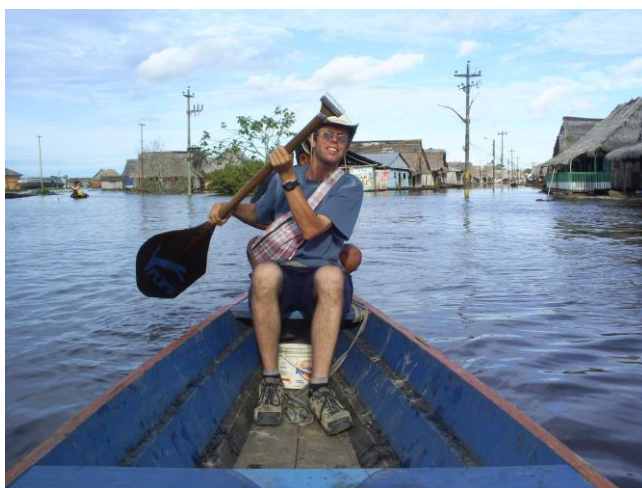
The author paddling a canoe in Belen, Iquitos, Peru