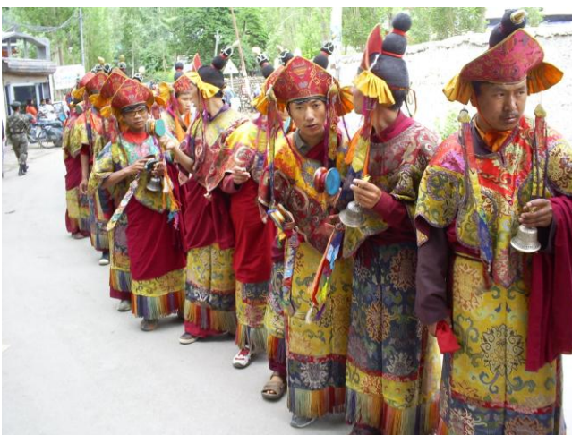
Procession of monks in Leh, Ladakh, India