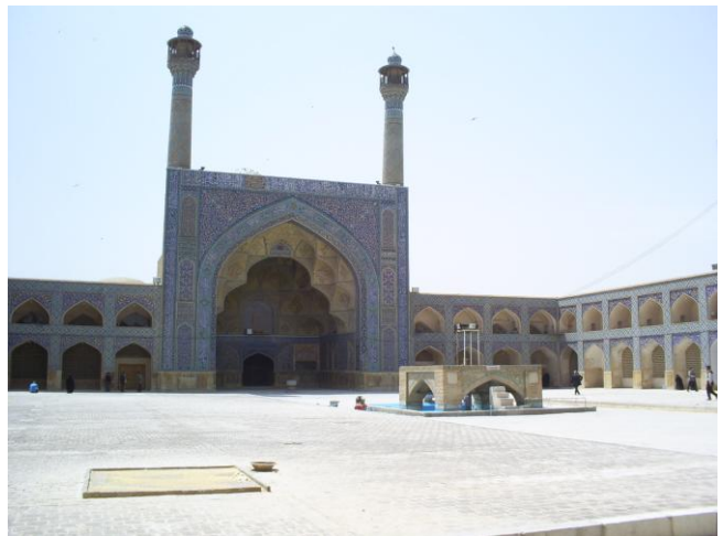
Imam Square, Isfahan, Iran