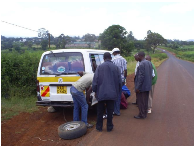
Between Nairobi and Karatina, Kenya