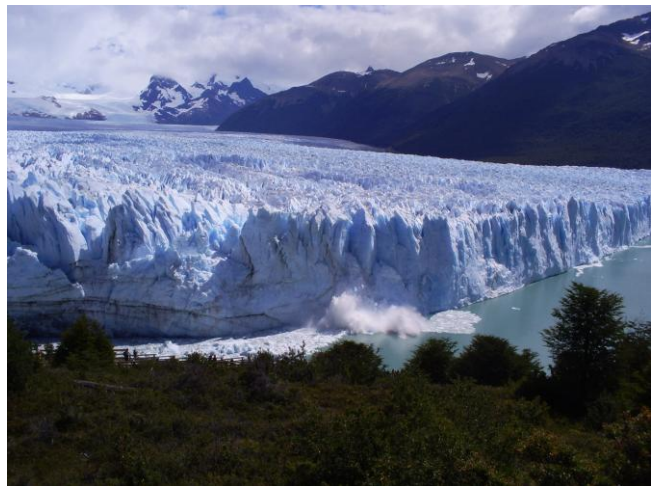
The Perito Moreno Glacier, Argentina