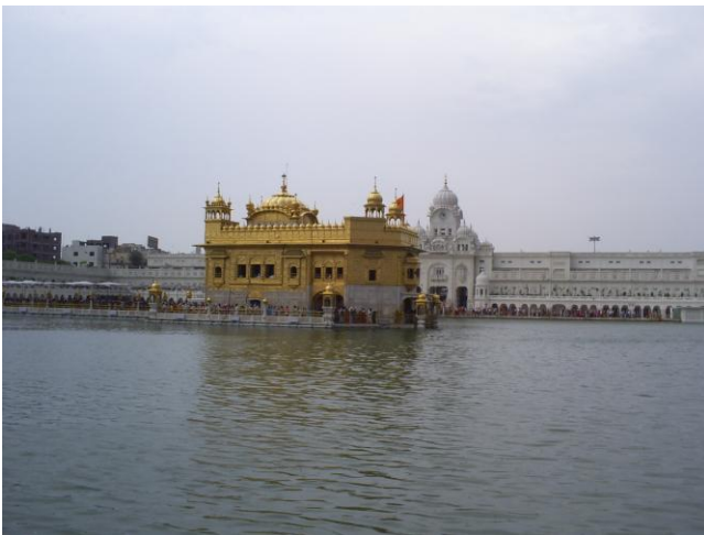
The golden temple of Amritsar, India