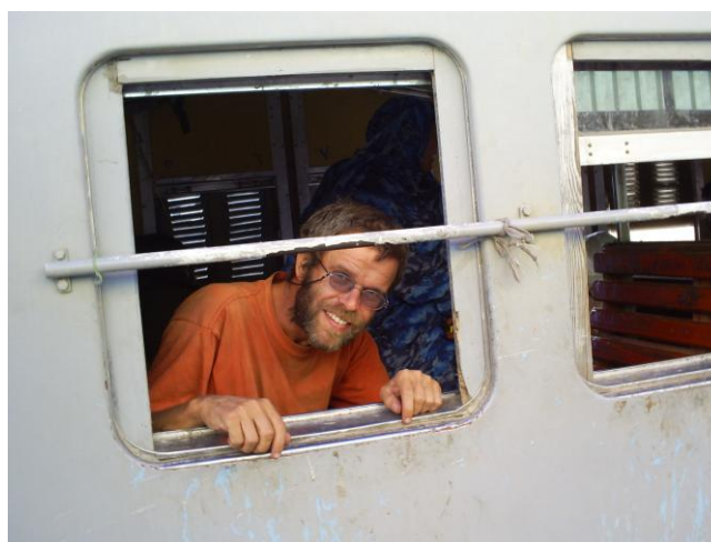
The author in the train from Khartoum to Wadi Halfa, Sudan