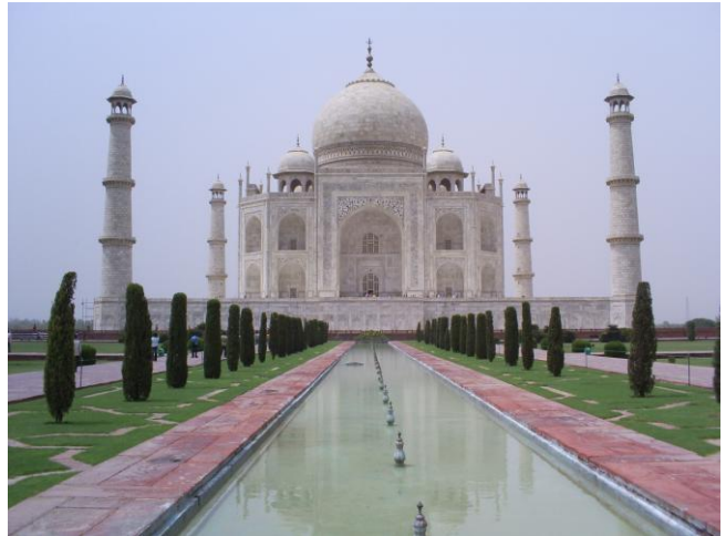
Taj Mahal, Agra, India