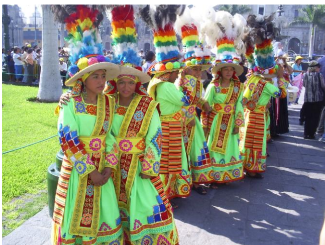
Traditional Dancers, Lima, Peru