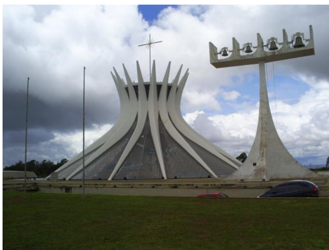
The Catedral, Brasília, Brasil