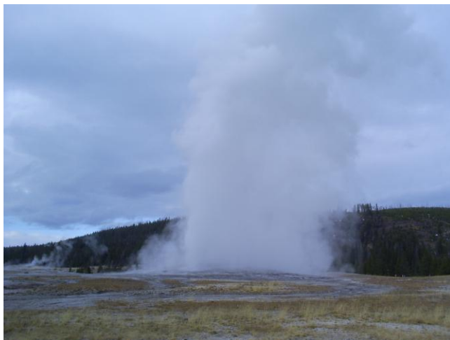
Old Faithful, Yellowstone Park, USA