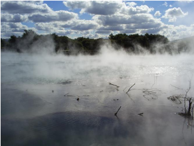
Volcanic Spring, Rotorua, New Zealand