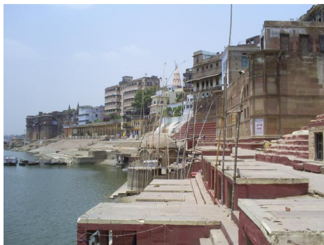
Dar Ghat, Ram Ghat, Mesta Ghat at the Ganges rivershore in Varanasi, India