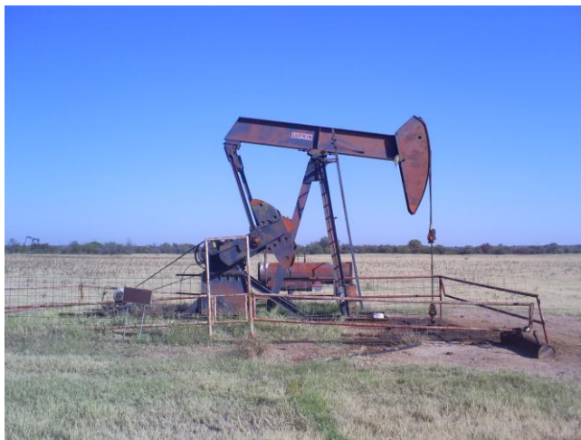
Oil well between Lamesa and Dallas, TX, USA