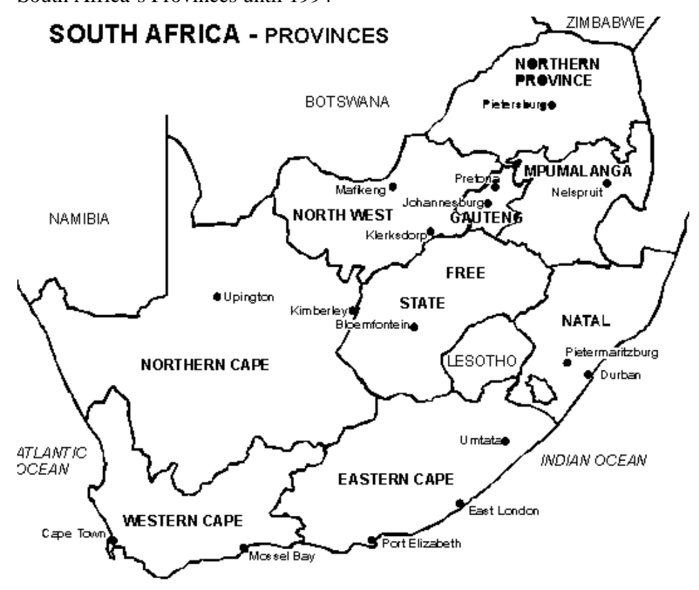
South Africa's Provinces from 1994